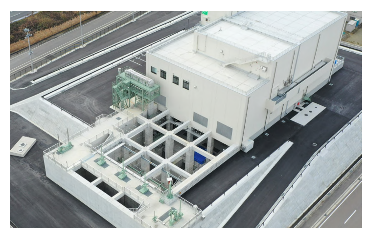
Ishinomaki port drainage pump station and 2 other facilities reconstruction work No.2

Renowned for our products and services, as well as the knowledge of our employees, we are constantly developing and investing in new technologies and systems to support continuous improvement.