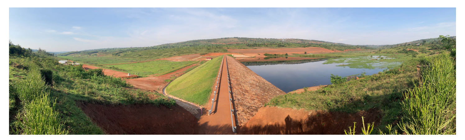
Rehabilitation of Irrigation Facilities in Rwamagana District [Rwanda]

We are working just as hard today to establish a corporate culture commensurate with the challenges of building the structures that people around the world need in order to enjoy better lives.