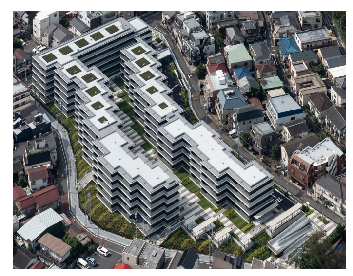
Tokyo Fire Department Honmachi living quarters [Tokyo]

Renowned for our products and services, as well as the knowledge of our employees, we are constantly developing and investing in new technologies and systems to support continuous improvement.