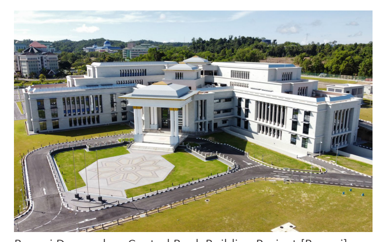
Brunei Darussalam Central Bank Building Project [Brunei]

Moreover, we have expanded our business domains by responding to the demands of the times. We are now engaged in solutions businesses that meet the varied needs of our customers in addition to construction work. We will strengthen our explorations into new areas where Tobishima can fully apply its expertise in engineering and disaster prevention.