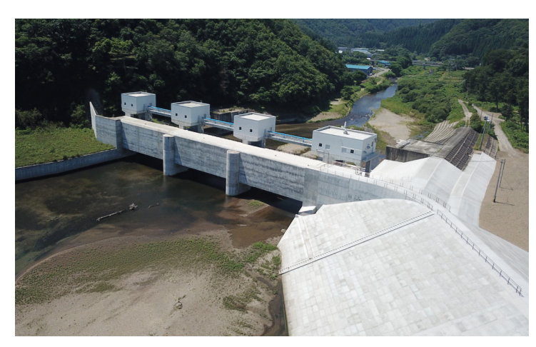
Disaster restoration work at Tashiro River sluice gate and surrounding area [Iwate]

Renowned for our products and services, as well as the knowledge of our employees, we are constantly developing and investing in new technologies and systems to support continuous improvement.